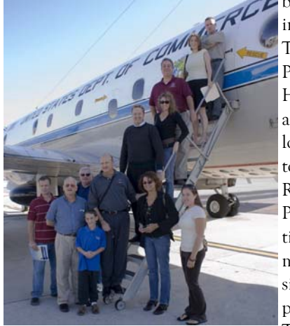
USF and Local AMS Members tour the hurricane hunter airplane at MacDill Airforce Base.