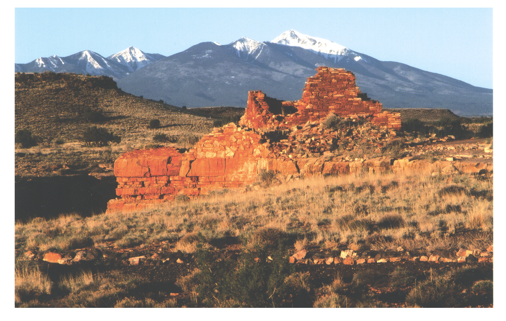
The peaks of San Francisco Mountain, an eroded stratovolcano—which includes Arizona's highest point, Humphreys Peak at 12,633 feet—tower over the ruins of an ancient Native American pueblo in Wupatki National Monument. The ancient inhabitants of this area must have witnessed the eruption of nearby Sunset Crater, the State's youngest volcano, which erupted in about A.D. 1064. San Francisco Mountain and Sunset Crater are only two of the hundreds of volcanoes in the San Francisco Volcanic Field, which covers about 1,800 square miles of northern Arizona.

Why does Northern Arizona have so many geologically young volcanoes? Most volcanoes are located near boundaries of the Earth's tectonic plates, but Arizona is well within the