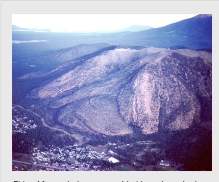
Elden Mountain is a steep-sided lava dome in the San Francisco Volcanic Field. Lava domes are formed by dacite and rhyolite magmas, which have high silica contents. Dacite and rhyolite are so viscous that they tend to pile up and form very steep-sided bulbous masses (domes) at the site of eruption.

Elden Mountain, at the eastern outskirts of Flagstaff, is an excellent example of an exogenous dacite dome and consists of several overlapping lobes of lava. Sugarloaf Mountain, at the entrance