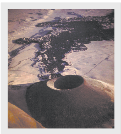
SP Crater, in the San Francisco Volcanic Field, is an excellent example of a cinder cone and associated lava flow. This flow extends 4 miles from the cone and is only about 100 feet thick.

A volcano is an opening where magma erupts onto the surface as lava after rising from deep within the Earth. Not all magma is the same. Some magma contains as much as 75% silica (SiO<sub>2</sub>), whereas other magma contains as little as about 50%. The more silica in a magma, the higher its viscosity, or resistance to flow. Viscosity controls the type of volcano that forms. Eruptions of high-viscosity magma build very steep-sided lava domes. Low-viscosity magma produces cinder cones and thin sheet-like lava